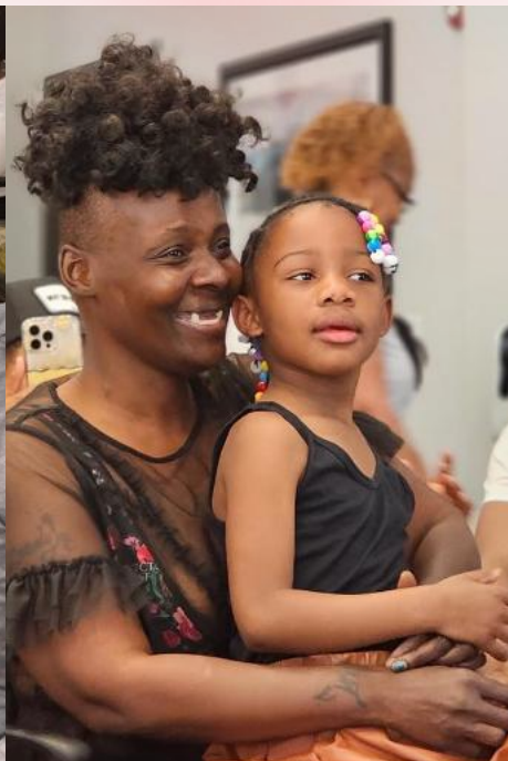
“This amazing woman confessed that this is the first thing she ever finished. That smile is one of triumph, rooted in years of false starts...”