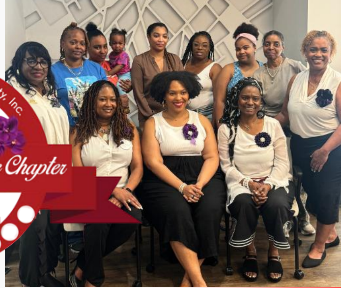
A special moment with our Cohort 3 mentees and their mentors. Together, they are creating strong partnerships that inspire growth, encouragement, and lasting impact.