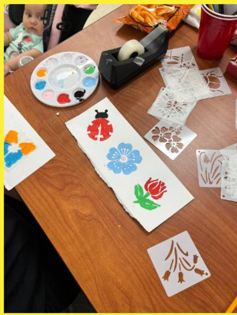
From stencils to freehand artwork, parents showcased their unique creativity through their designs.