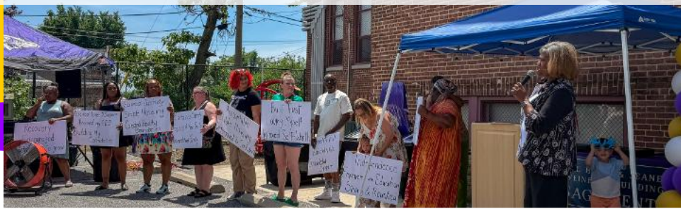
Everyone proudly holding their "after" signs, celebrating their journeys of recovery, growth, and transformation.