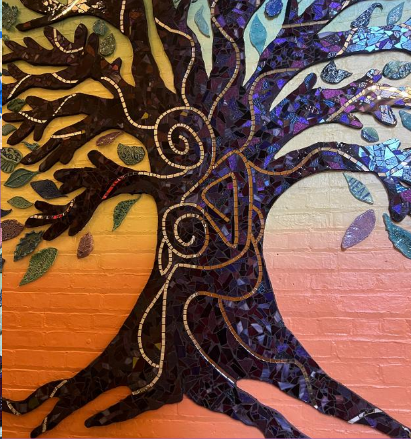
The completed Recovery Tree living on the 2 nd Floor at the Sage Center