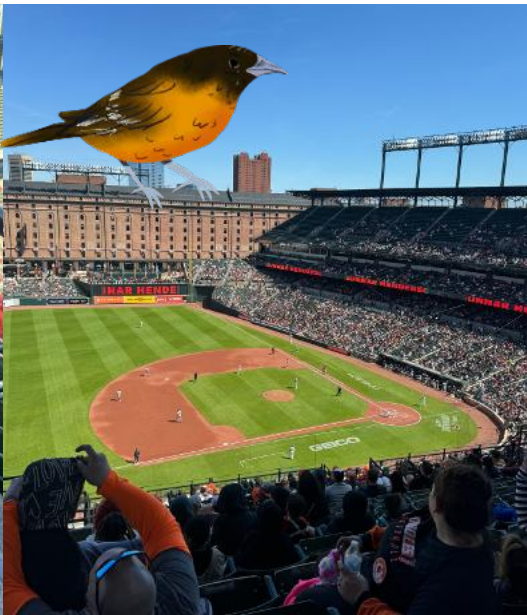
It was a beautiful day to watch the winning game!