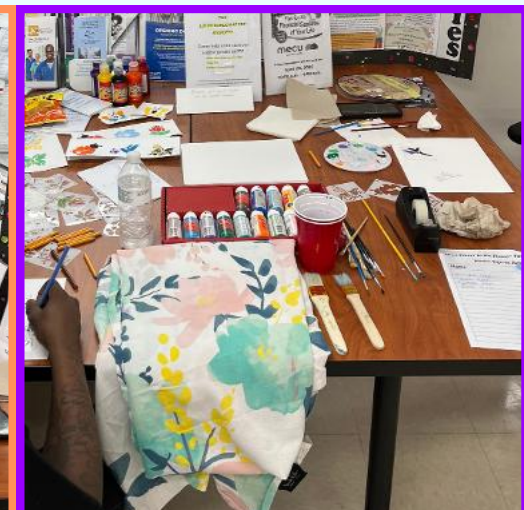
A messy table is a sign of a successful day!