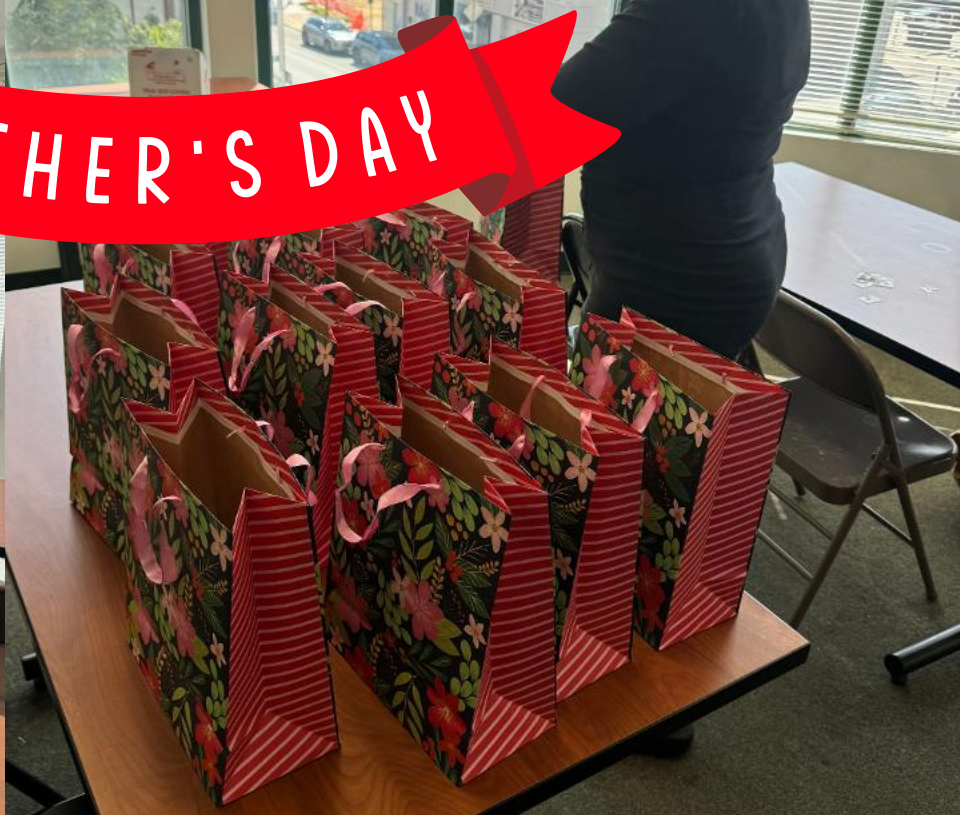
Their carefully wrapped gifts they made for our FRP mothers!

We extend a heartfelt thank you to The Sisters of Delta Sigma Theta Sorority, Inc. for generously providing beautiful Mother's Day bags for the Mother's at the Sage Center.