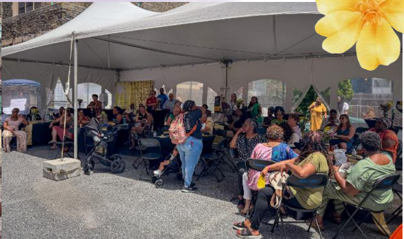
We were thrilled by the great turnout and deeply appreciate everyone who contributed to making this day possible.