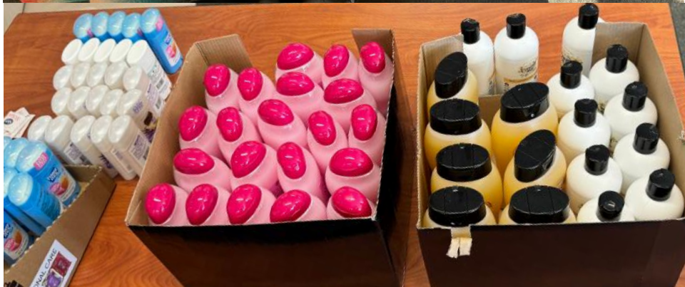
A closer look at some of the items included in the Mother's Day gift bags