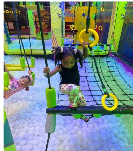
(Kids enjoying the gym)