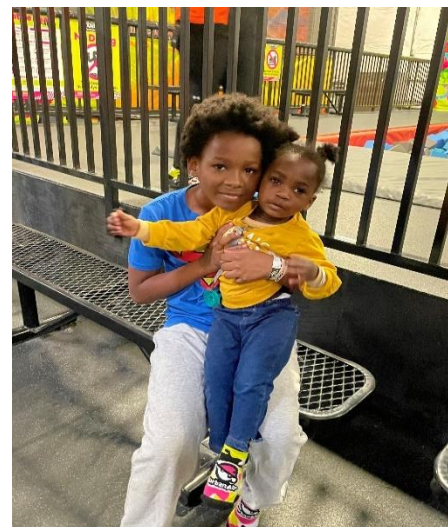
(Big brother and little sister taking a break)