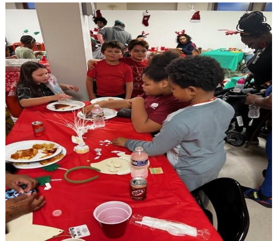
(Arts and crafts while waiting for Santa)

On December 19, families came together at Sage to have fun. There was food, arts and crafts, and a surprise visit from Santa Claus and his bag full of gifts!