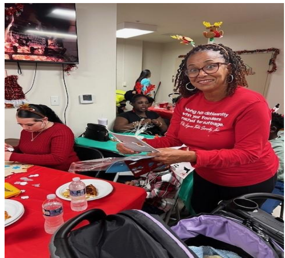
(Delta Sigma Theta Sorority volunteered to help things run smoothly)