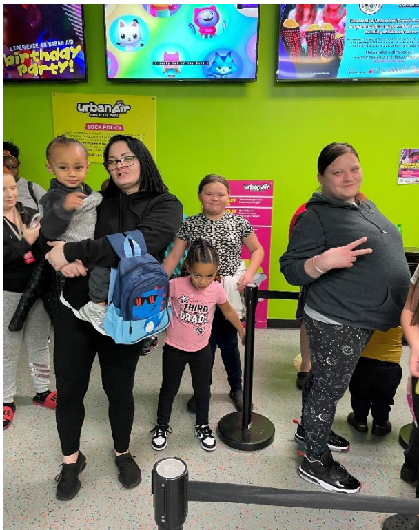
(Preparing for a day of adventure at Urban Air)

In January 2024, FRP Family Matters: Family Drug Treatment Court Initiative began providing substance use disorder treatment and family reunification services to our families with more supports to the entire family. This is made possible through SAMHSA, agency within the U.S. Department of Health and Human Services that leads public health efforts to advance the behavioral health of the country. Their goal is to make substance use and mental health disorder information, service, and research more accessible.