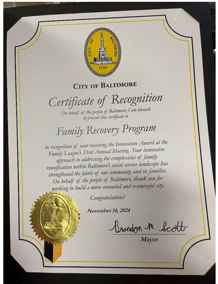
(The Innovation Award at the Family League's 33 rd Annual Meeting)