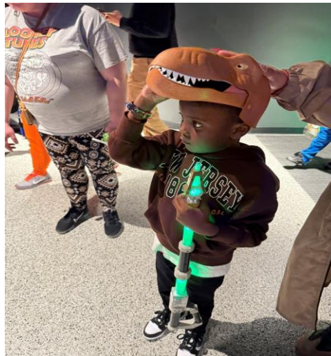
(A young Tyrannasaurus Rex was spotted)