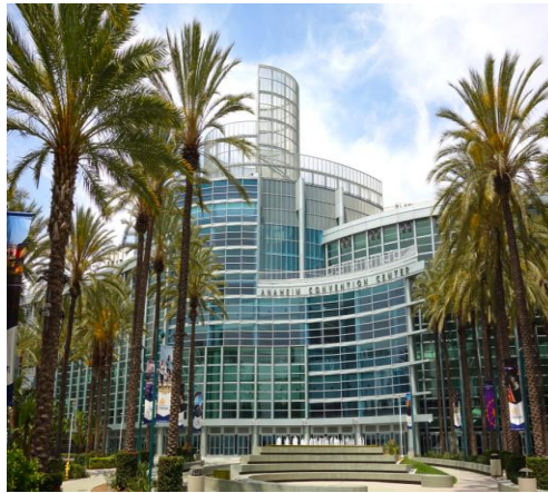
(Anaheim Convention Center, Anaheim California)

For three decades, treatment courts have proven that a combination of treatment and compassion can lead those with SUD and or mental health disorders into lives of stability, good health, and recovery.