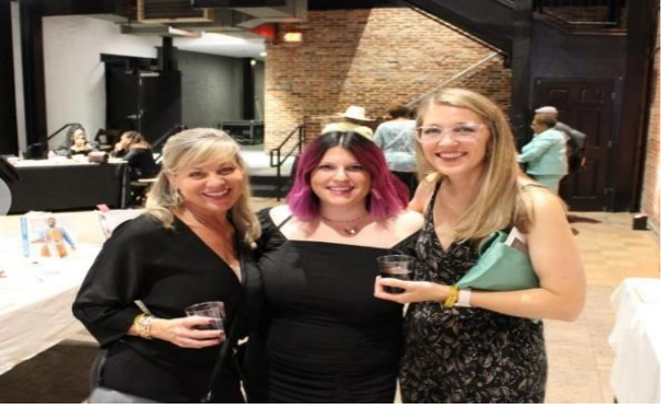
(Casino Night Guests)

The night wouldn't be complete without music and DJ Boobie had everyone on the floor doing the latest line dances. If you weren't there, hopefully we'll see you at the next fundraiser.